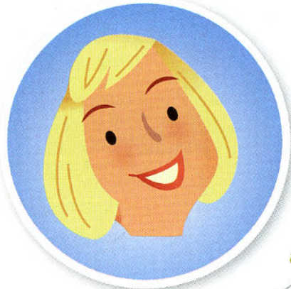
54 Wisdom of the Crowd