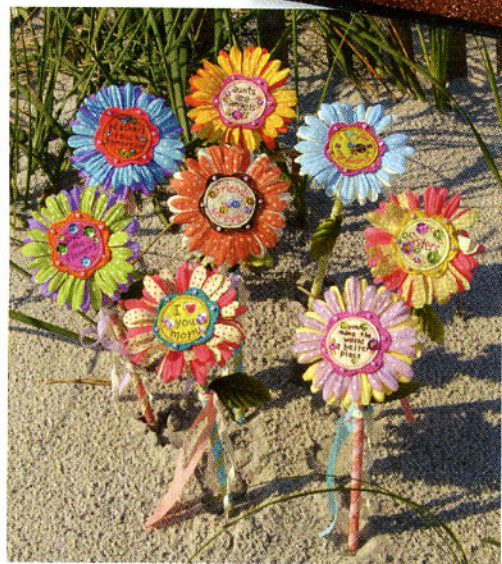
48 Paper Trail