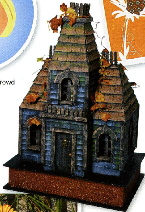
40 Boo Who?